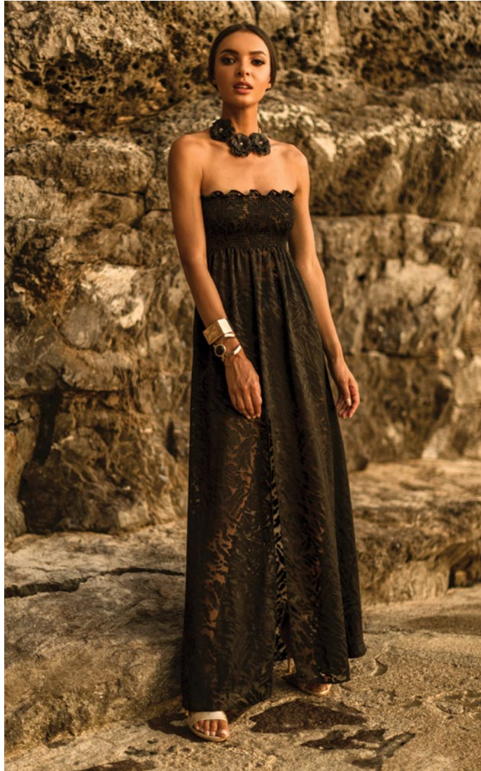
Kate Resort Dress - Blend Of Silk