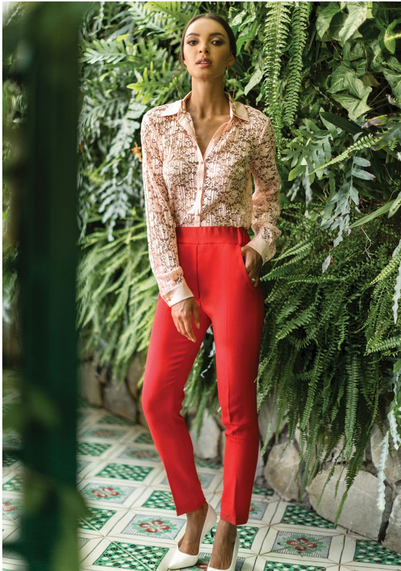
Pink Lace Shirt / Diane Red Pants