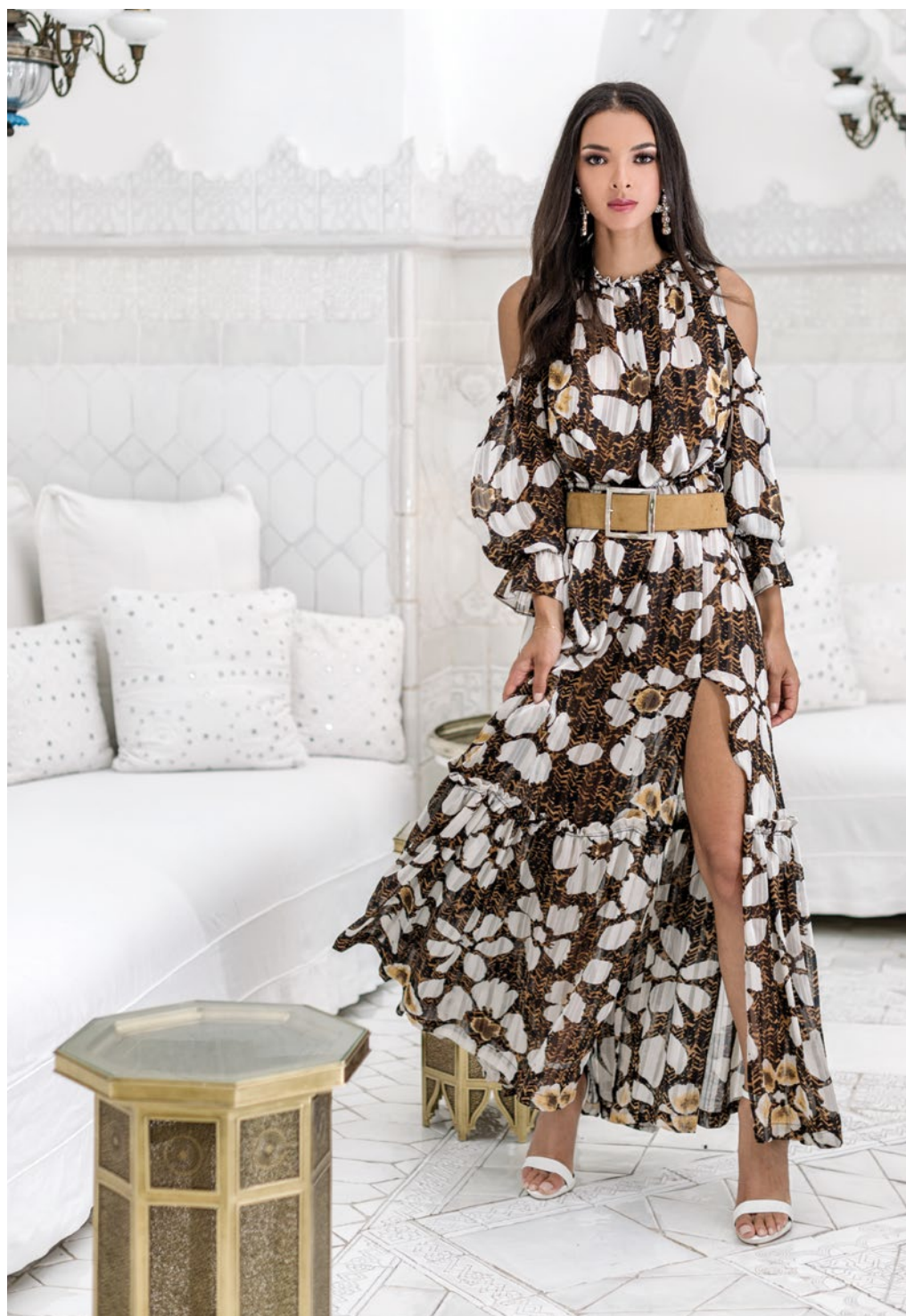
Elisa Maxi Dress