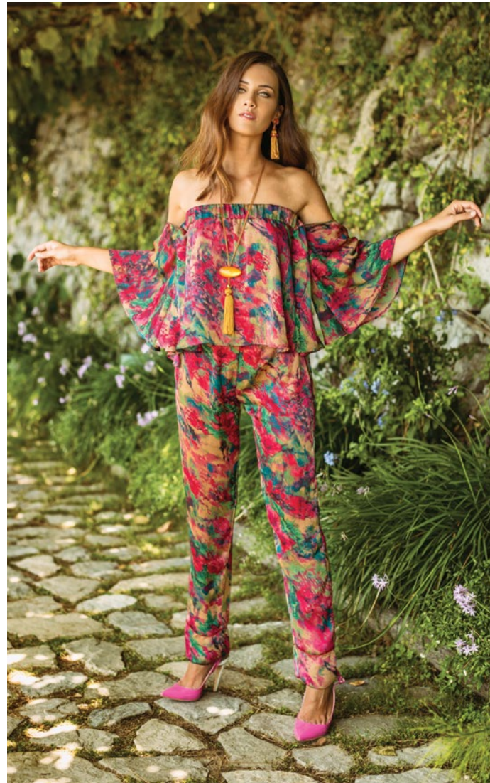
Nicola Top / Lauren Set Print Roses Pants