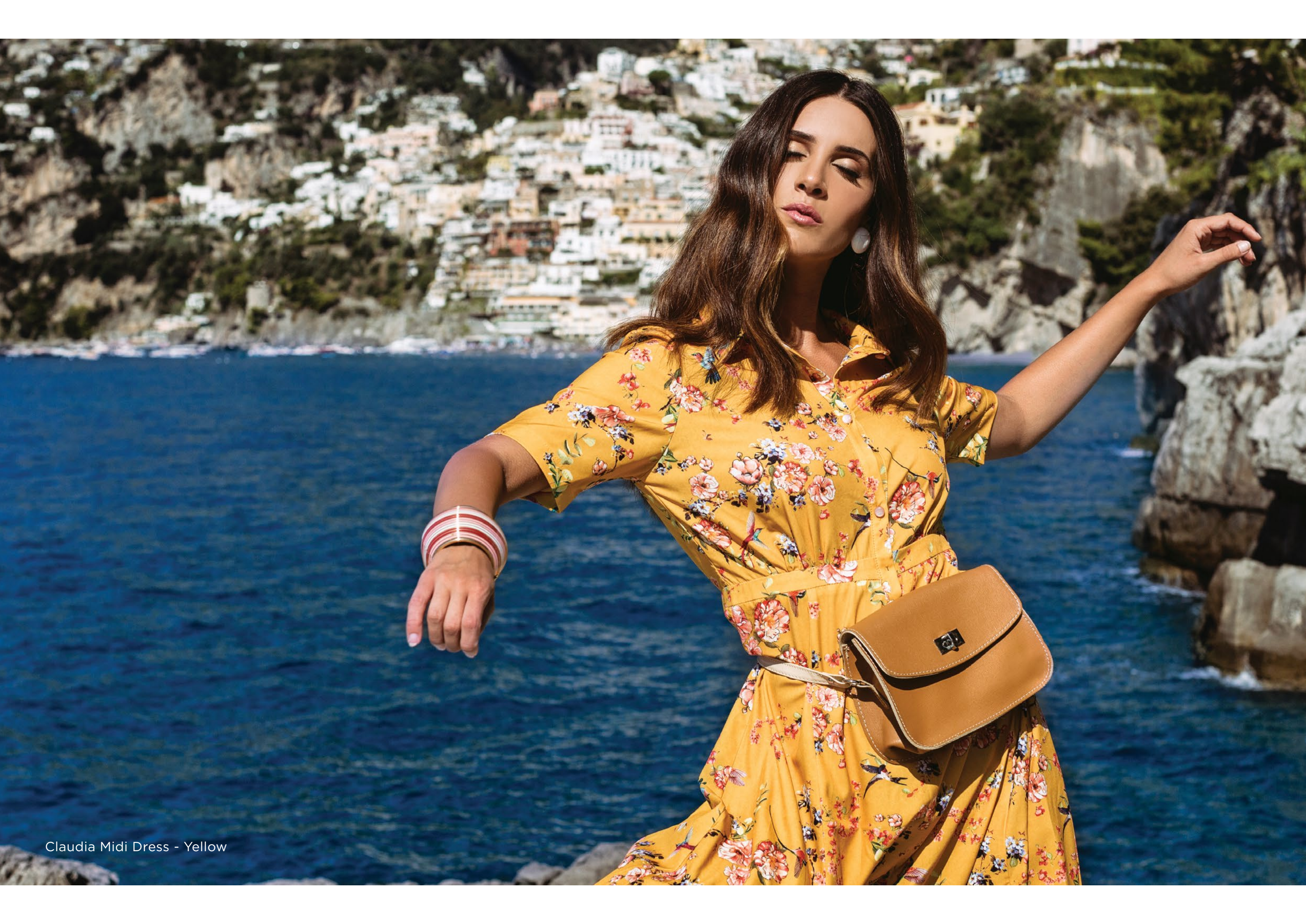
Claudia Midi Dress - Yellow