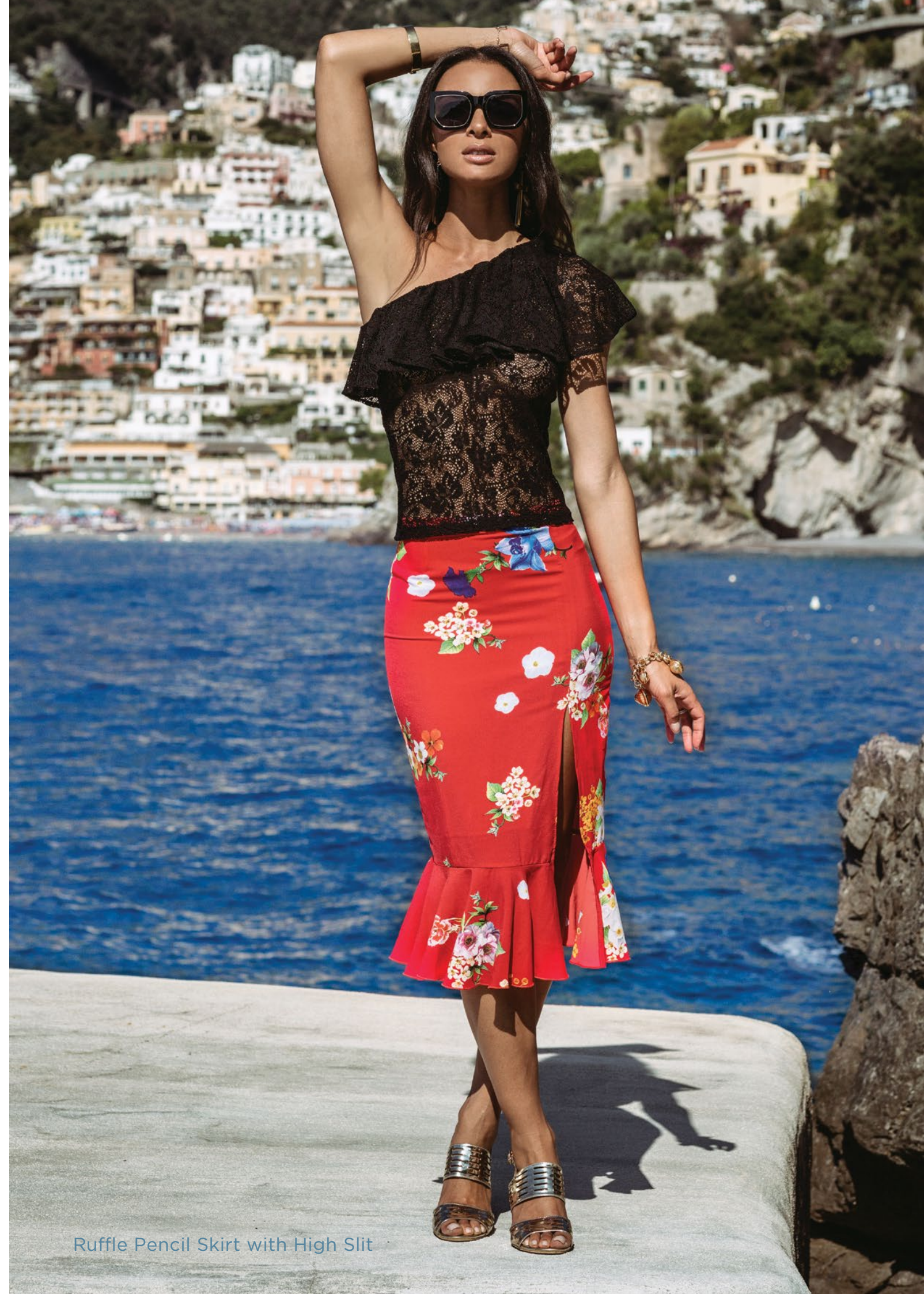
Ruffle Pencil Skirt with High Slit