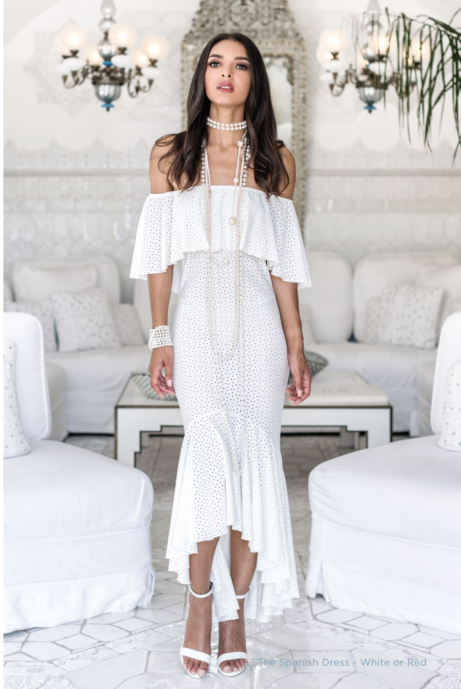
The Spanish Dress - White or Red