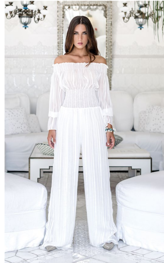
Off Shoulder Jumpsuit