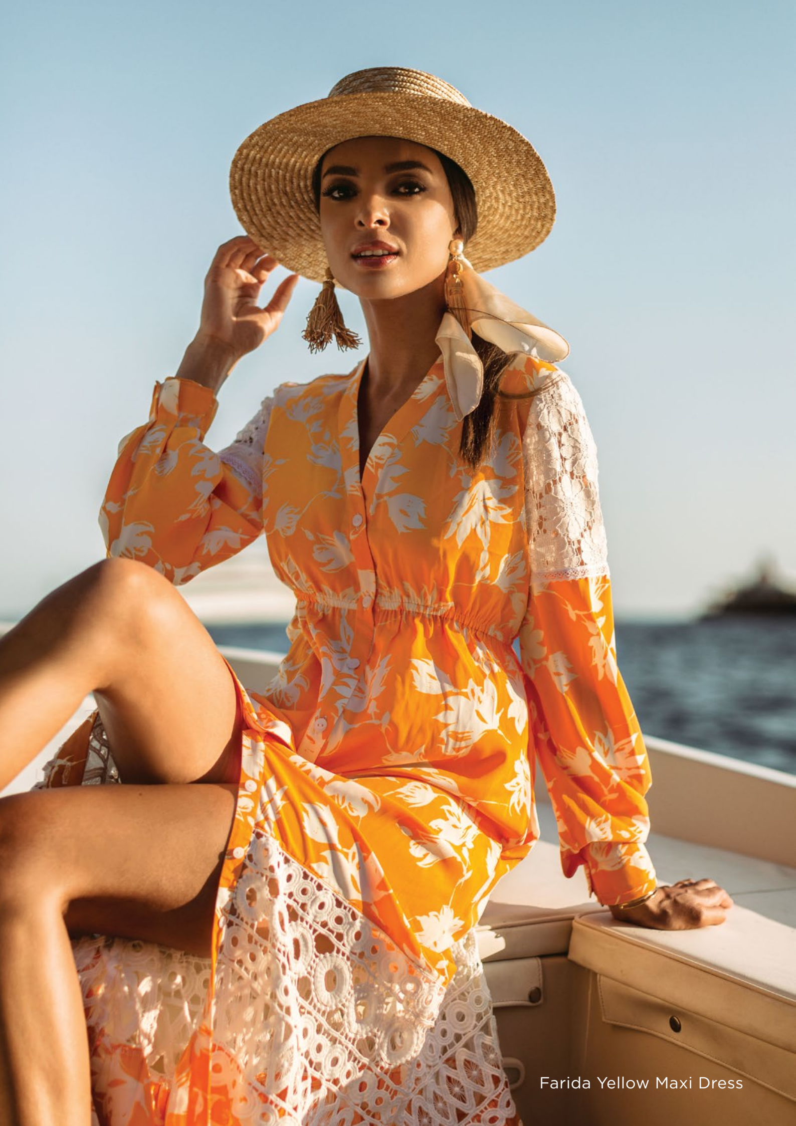
Farida Yellow Maxi Dress