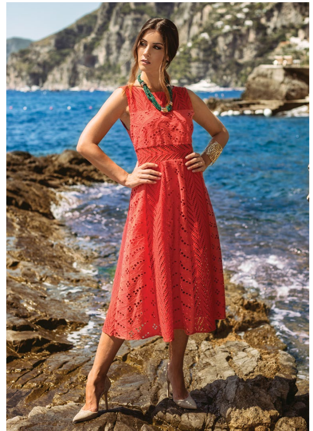
Sandra Midi Embroidered Cotton Dress