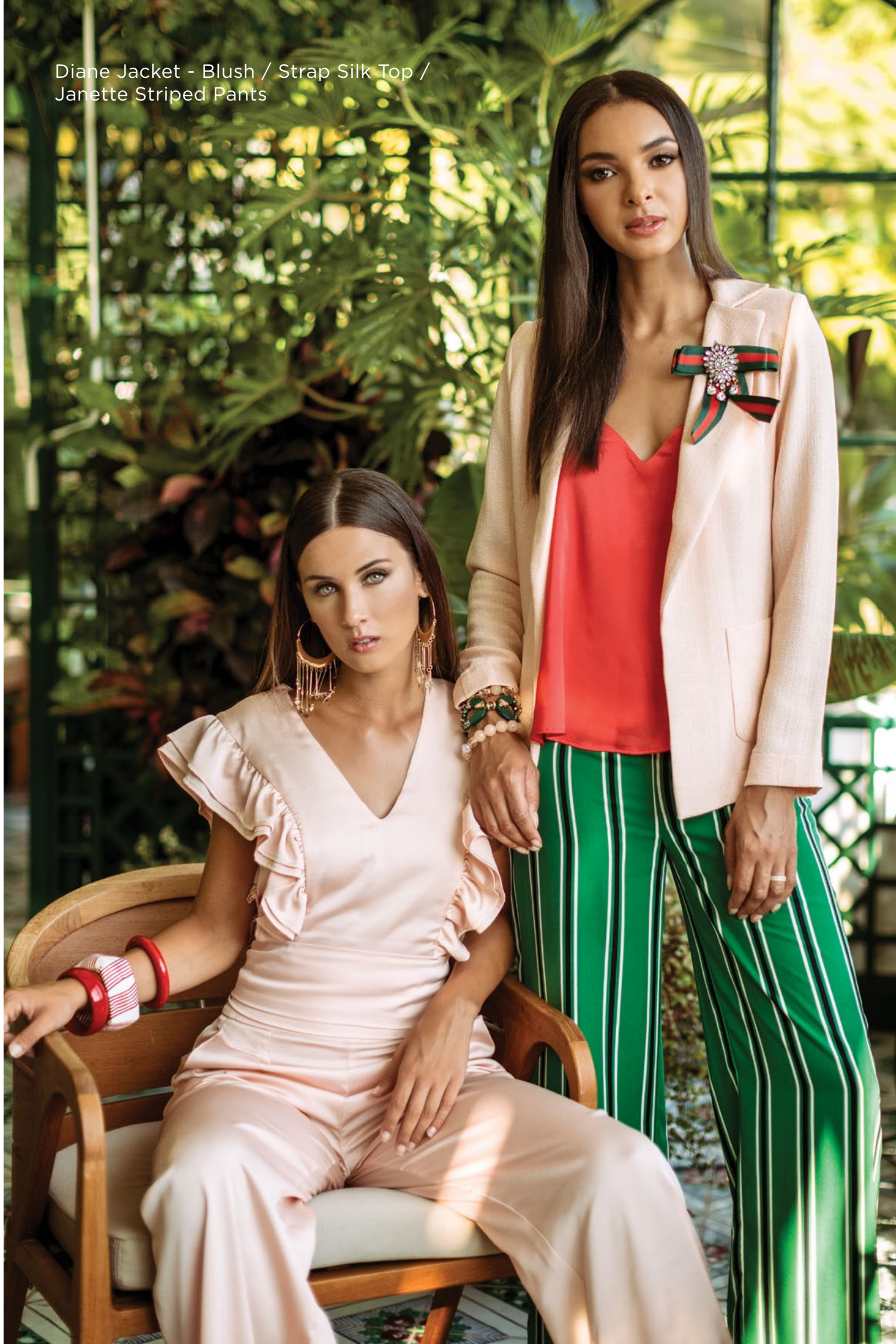
Diane Jacket - Blush / Strap Silk Top / Janette Striped Pants