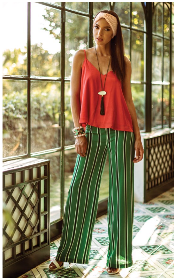
Strap Silk Top / Janette Striped Pants