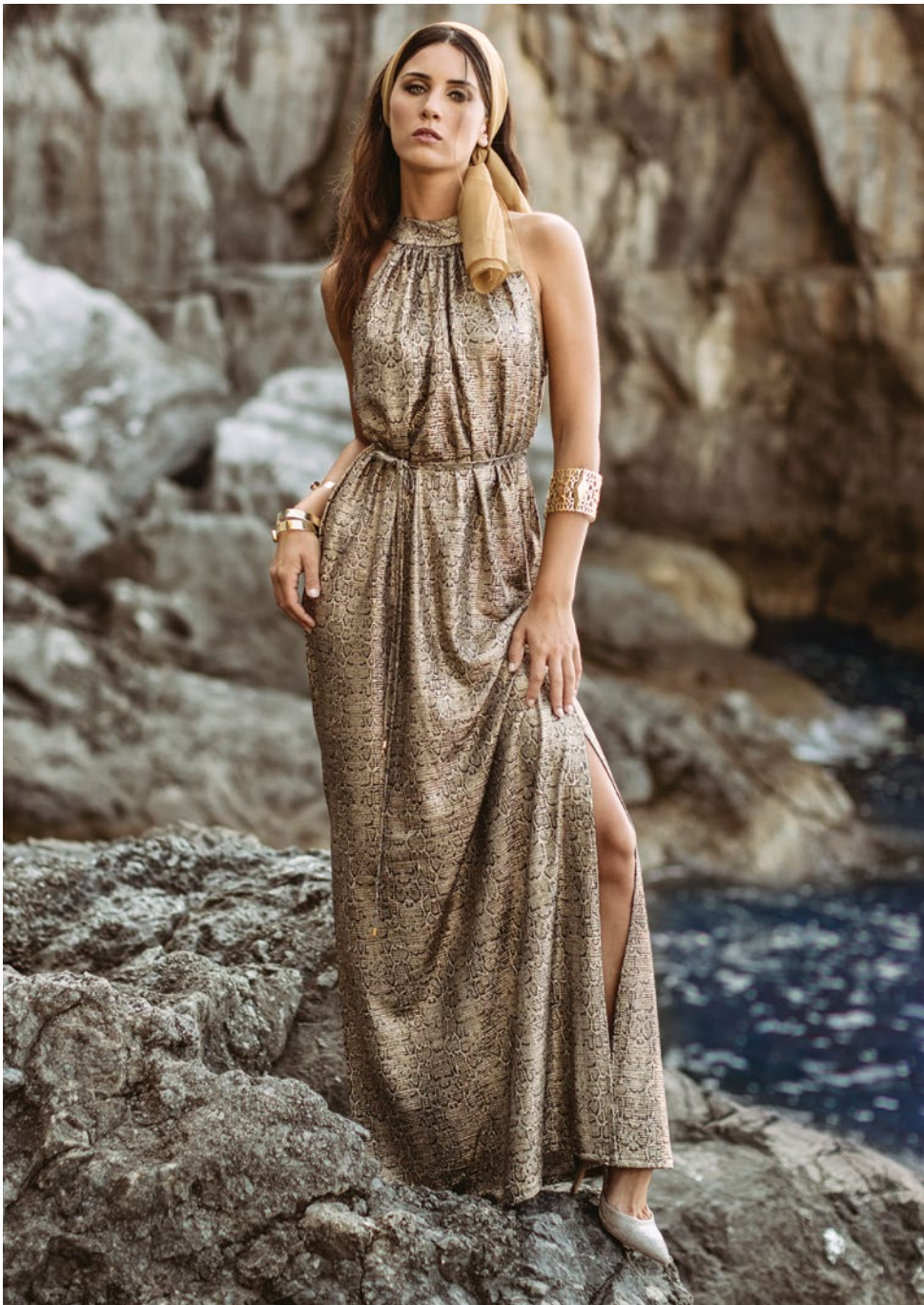
St Tropez Dress