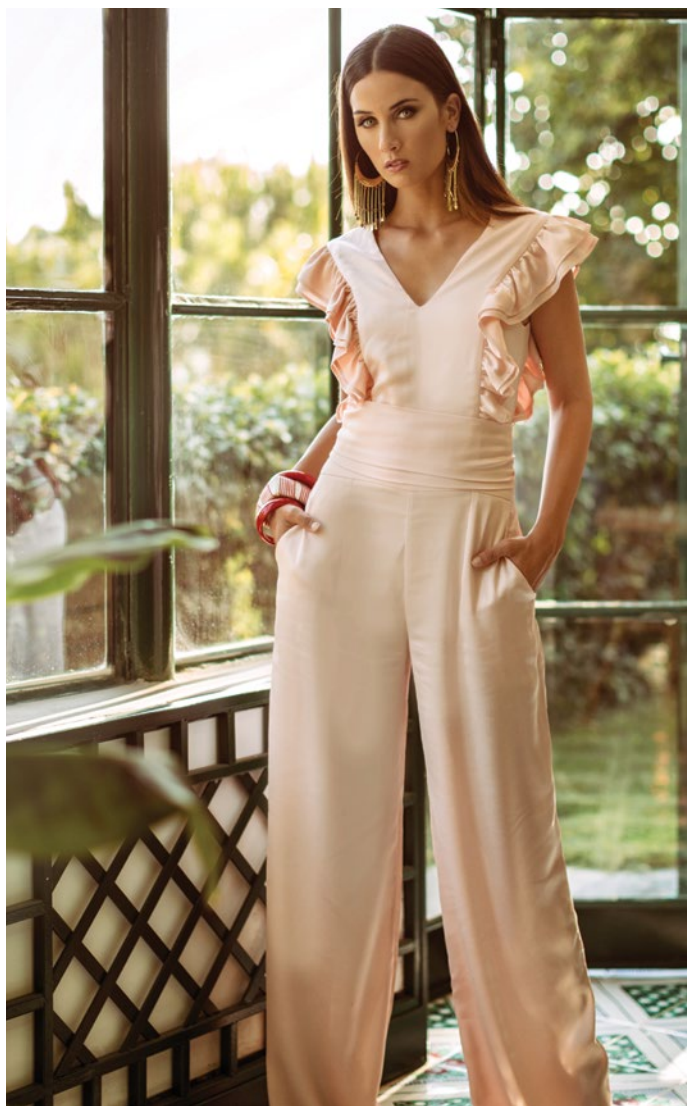
Bianca Jumpsuit - Light Pink