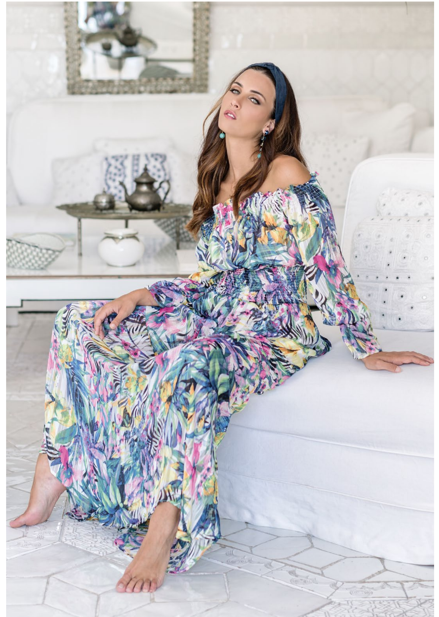
Carine Maxi Dress