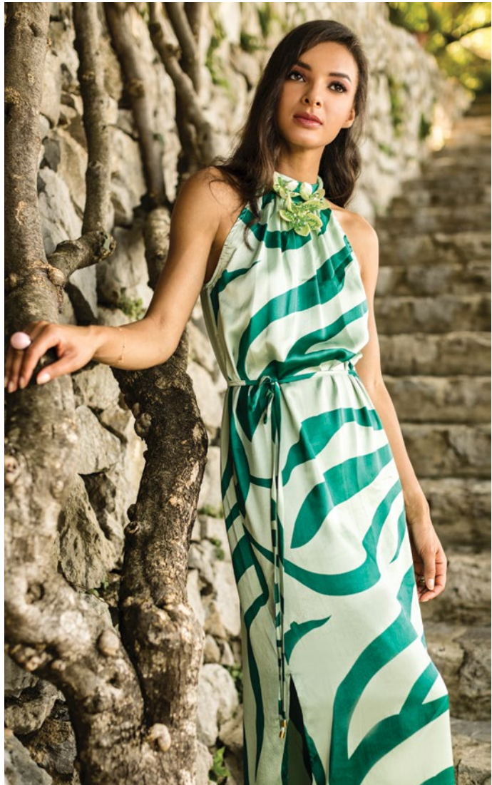
St Tropez Silk Dress