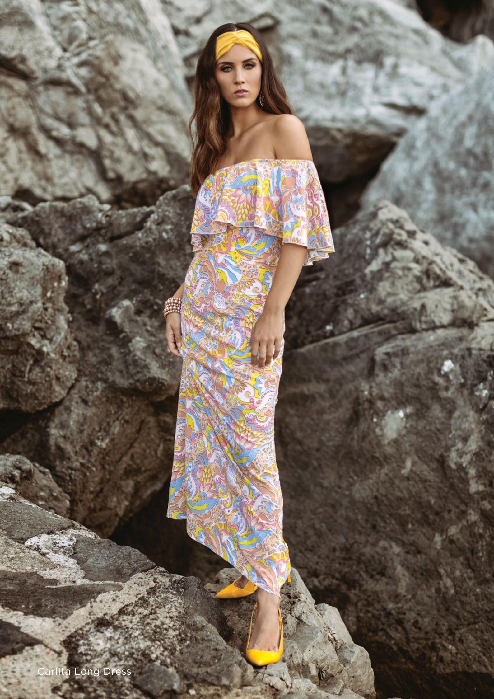
Carlita Long Dress