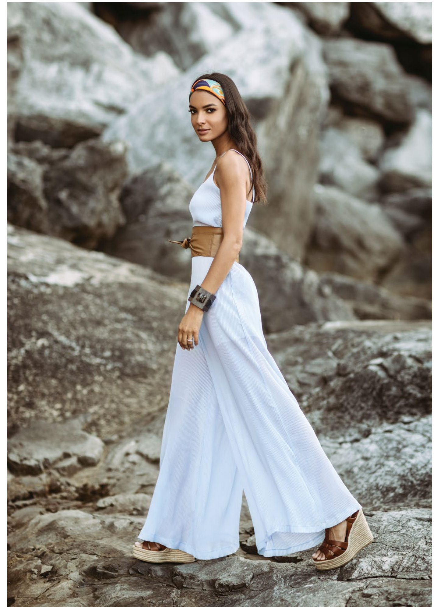
Maxi Jumpsuit / Eco Leather Belt