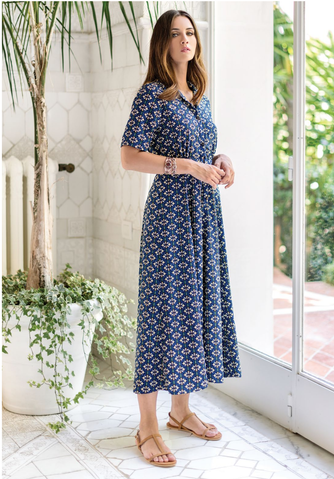
Claudia Midi Dress