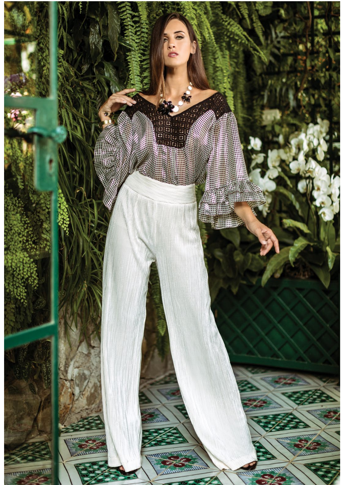
Boho Silk Guipure Top / Janette High Waist Pleated Pants