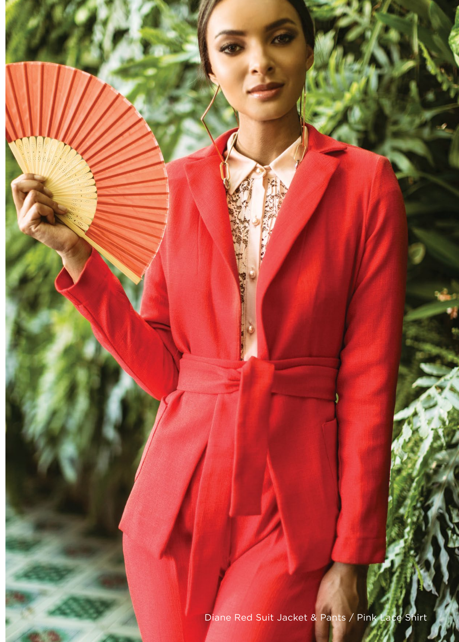
Diane Red Suit Jacket & Pants / Pink Lace Shirt