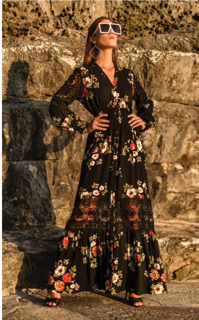
Farida Dress Black Print Cotton with Lace & Guipure Insert