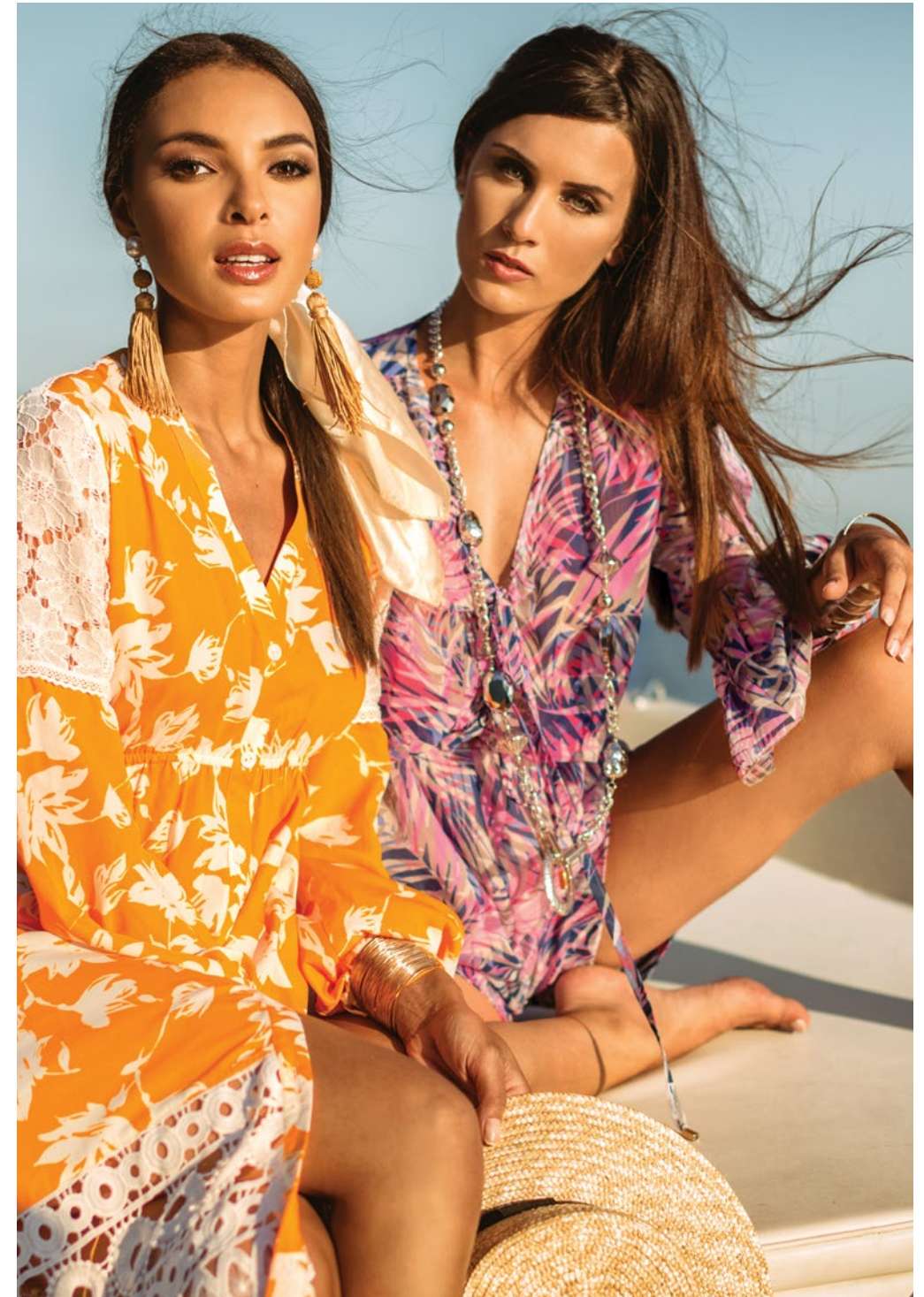
Farida Yellow Maxi Dress / Amy Short Jumpsuit