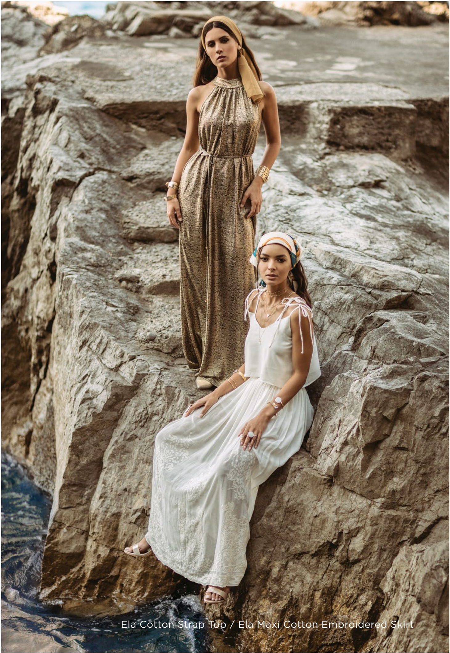
Ela Cotton Strap Top / Ela Maxi Cotton Embroidered Skirt