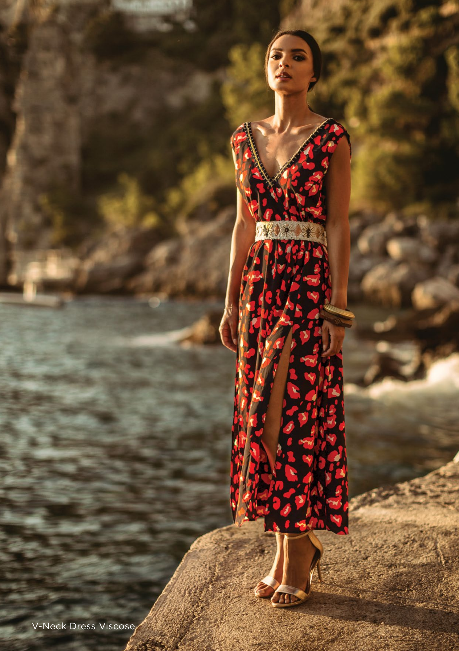
V-Neck Dress Viscose