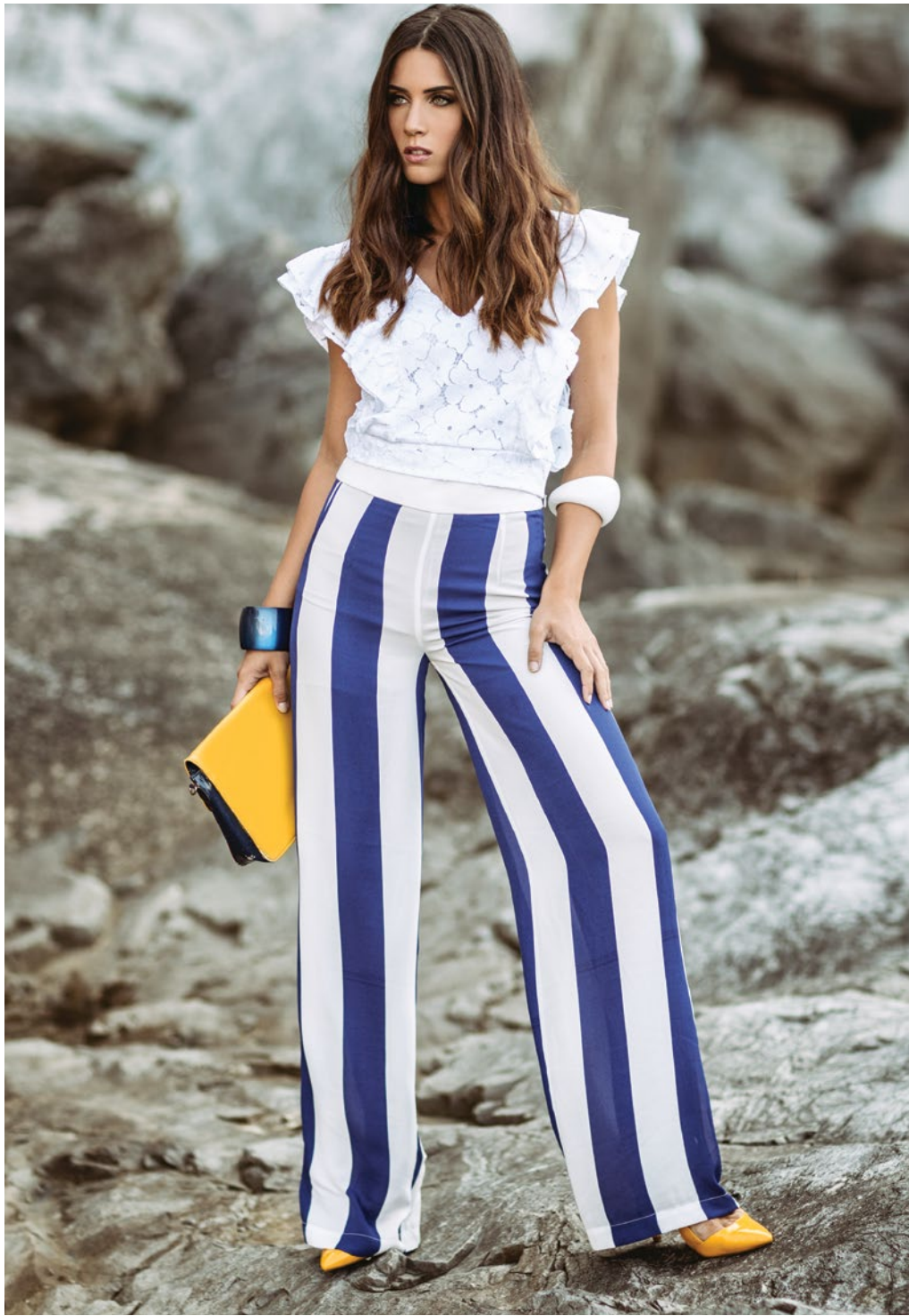
Bianca Embroidered Crop Top / Janette Lined Pants