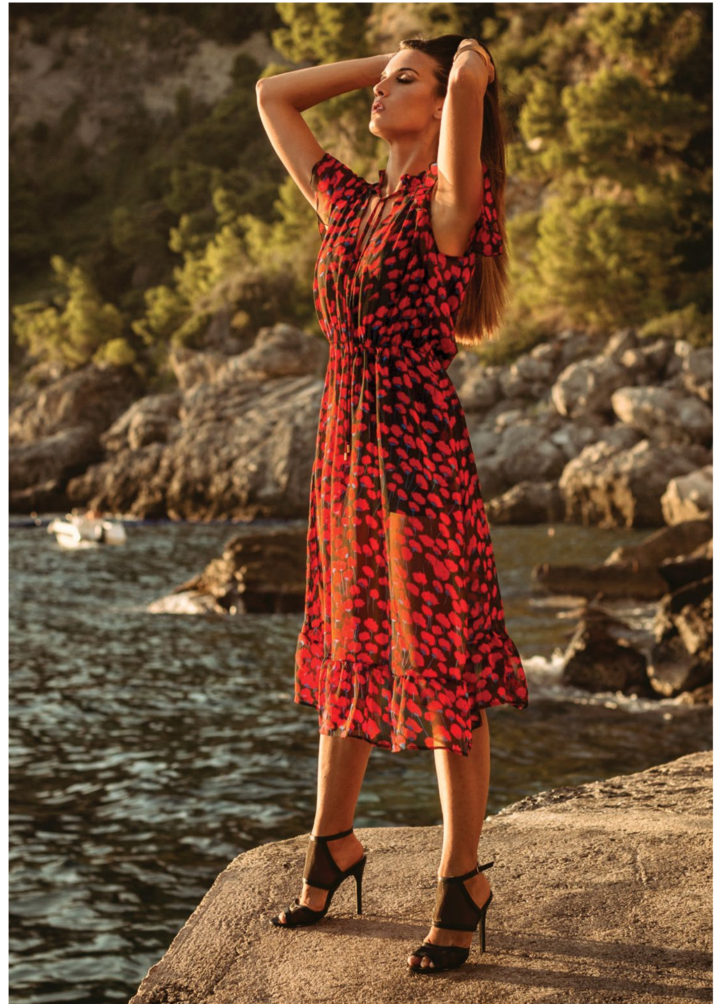
Mila Midi Dress