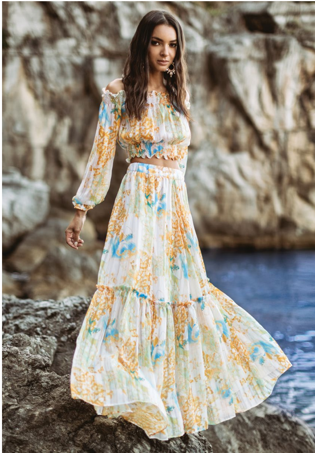
Kelly Maxi Skirt / Kelly Crop Top